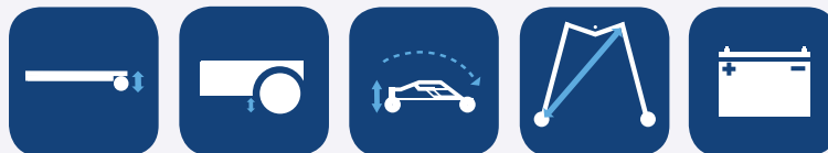
Height of legs ▼ Ground clearance ▼ Height when folded ▼ Turning diameter ▼ *Working ability ▼