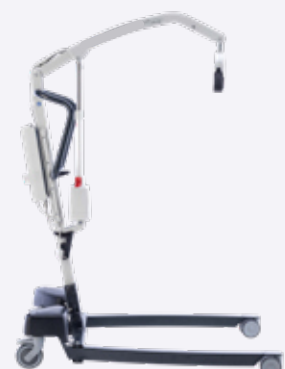
ICON PORTABLE PLUS

A smaller size allows the ICON PORTABLE COMPACT to easily operate in environments where space is limited.