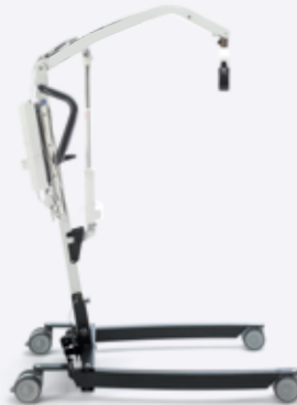
ICON PORTABLE COMPACT

A redesigned version of market leading mobile hoists, designed to support safe transfers in both domestic and residential care.