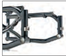
2 HYBRID FRAME DESIGN Eliminates the need for both hemi and standard frame, while providing a complete range of seat-to-floor heights