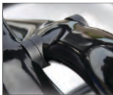
4 ULTRARIGID FOLDING SYSTEM Offers best-in-class propulsion efficiency