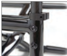
1 REINFORCED BACK CANE SUPPORT For added stability and comfort