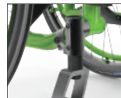
6 INTEGRATED CASTER HOUSING Offers simple and infinite angle adjustments