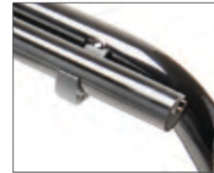
3 ALUMINIUM SEAT RAIL With integrated seat slider for better seat sling support