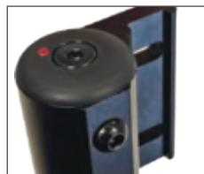
5 ANTI-FLUTTER SYSTEM Provides a smooth, more efficient ride